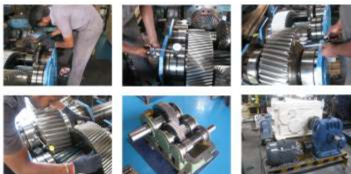
Top Quality In-house Servicing Facility

Monopoly In Industrial Gearbox Services In India with Over 2,000 + Gearboxes Expertly Serviced.